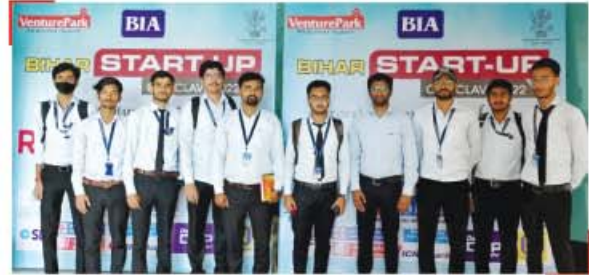
Students Participation in State level Start up Conclave

After education, every student faces a question 'what next.' Human capacities are infinite and can never be measured. But everyone has unique characteristics. The key to identify these unique qualities is career counselling. It involves scientifically developed aptitude and personality tests that help give the best suited career advice to the students. Such career itself translates into professional success and popularity. The main aim of career counselling is to help students choose a field that is in tune with their skills and their job expectations. Considering that, the college arranges sessions and invites experts of repute.