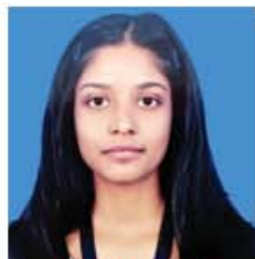
MANYATA MAHI TCS