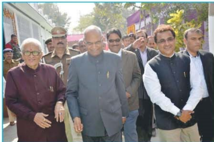
Hon'ble His Excellency Shri Ram Nath Kovind Ji visiting the campus on the eve of Annual Day Celebration, February 2016

Spread over a majestic six acres of land with the total built - up area of 60,000 Sq. ft, L. N. Mishra College of Business Management, Muzaffarpur, was established in 1973. For more than four decades, the College established itself as a centre of excellence imparting professional courses. The College has lush green eco-friendly campus, solar energy, wi-fi connectivity and state of the art infrastructures. The campus is under CCTV surveillance with 24 x 7 security.