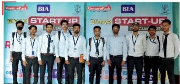
Students Participation in State level Start up Conclave

After education, every student faces a question 'what next.' Human capacities are infinite and can never be measured. But everyone has unique characteristics. The key to identify these unique qualities is career counselling. It involves scientifically developed aptitude and personality tests that help give the best suited career advice to the students. Such career itself translates into professional success and popularity. The main aim of career counselling is to help students choose a field that is in tune with their skills and their job expectations.